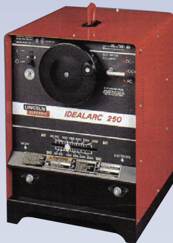
B Welder - Electric