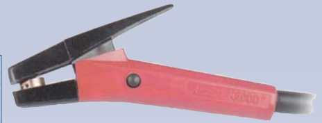
B Gouging outfit