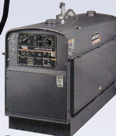
E Welder - Diesel