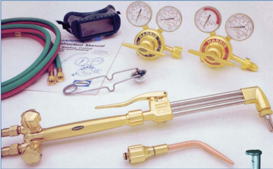
A Gas welding/cutting outfit