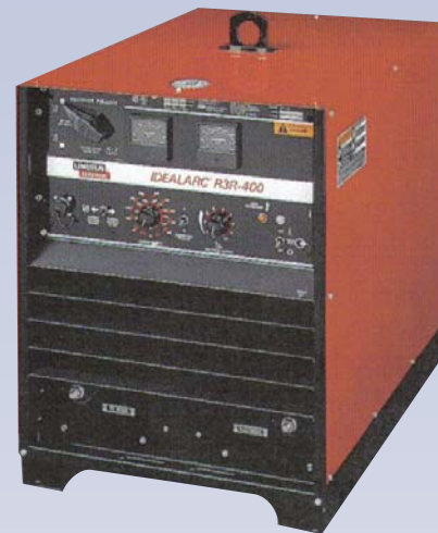
C Welder - Electric