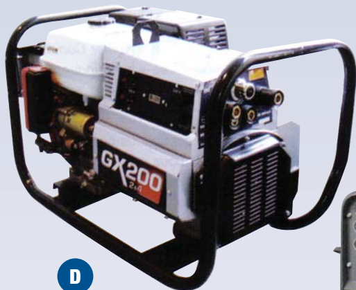
D Welder - Gas