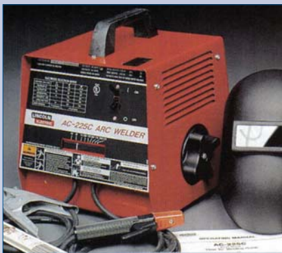
A Welder - Electric