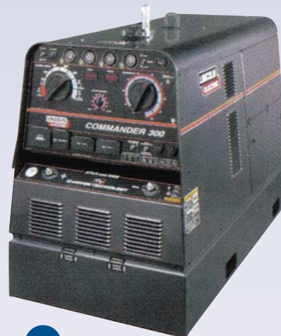
F Welder - Diesel