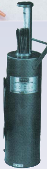
E Welding rod oven - 10 lbs