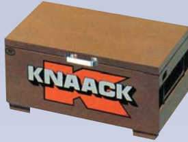
A Tool Chest - 30"