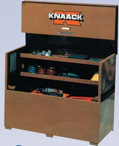
C Tool Chest - 60"