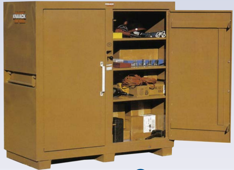
E Tool Cabinet