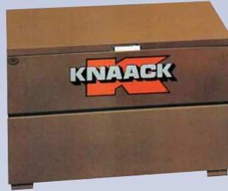
B Tool Chest - 48"