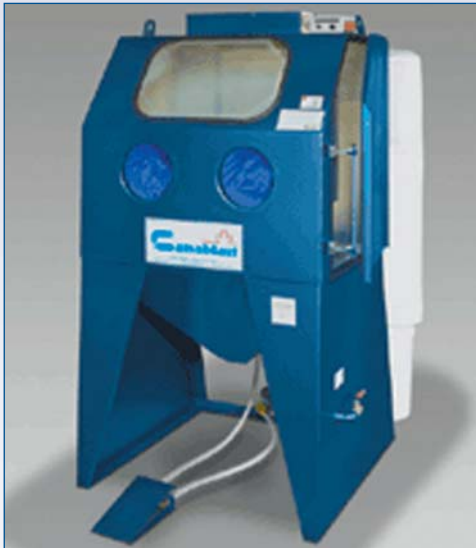
E Sandblasting Cabinet