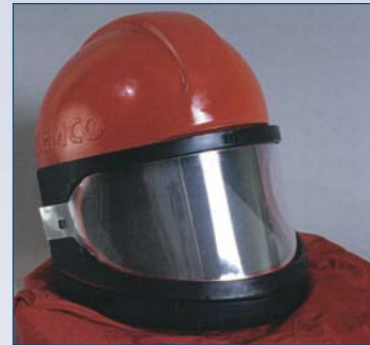
D Ventilation Hood