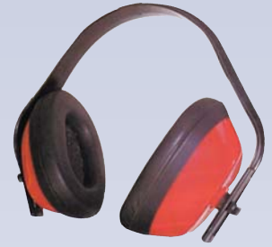
H Ear Muffs