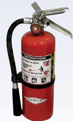
J Fire Extinguisher