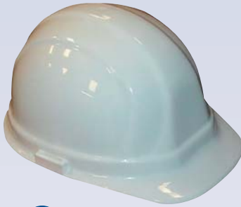
E Safety Hat