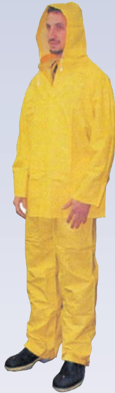
F Rain Suit