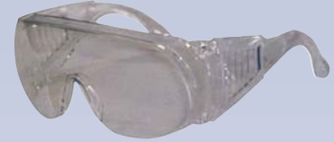
D Safety Glasses