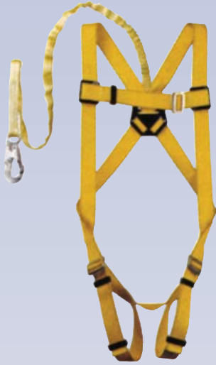
A Safety Harness - Full Body (with Lanyard)