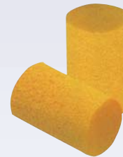
I Ear Plugs