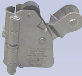
B Rope Grab