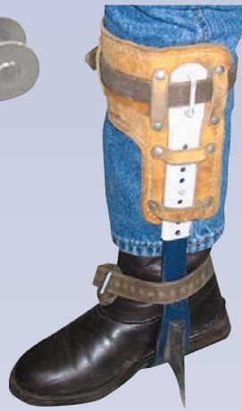
C Climbing Spikes