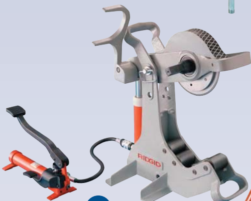
E Pipe cutter - Electric/Hydraulic