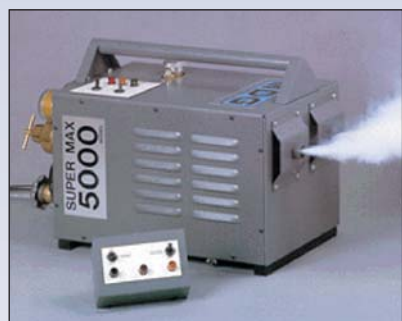
G Fog Machine