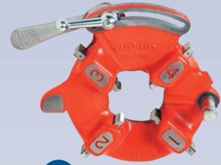
D Die Head w/ Die Set