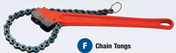
F Chain Tongs