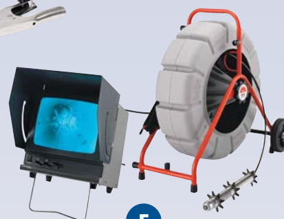
F Video Inspection System