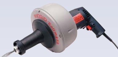
H Drain Cleaner - Electric