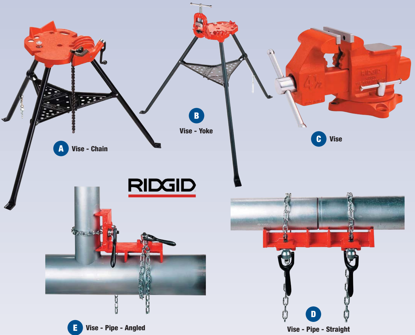
A Vise - Chain