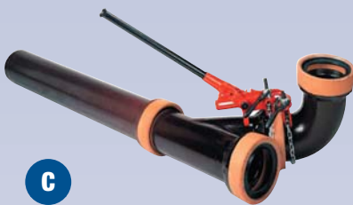
C Pipe Assembly Tool - Soil