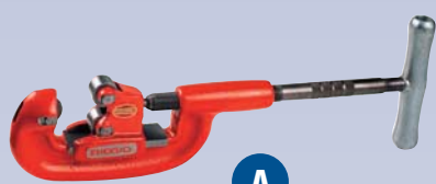
A Pipe Cutter - Manual - 1/8" to 6"