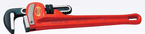
G Pipe Wrench