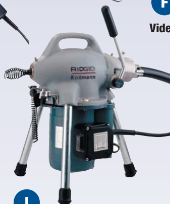
I Drain Cleaner - Electric