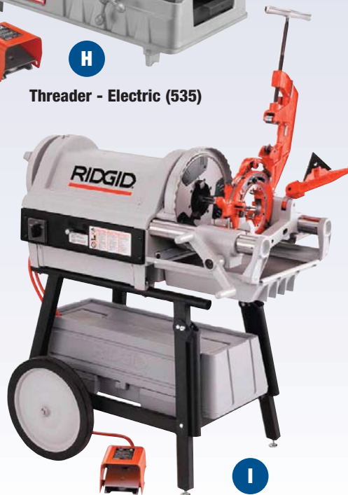
I Threader - Electric (1224)