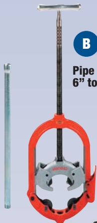
B Pipe Cutter - Manual 6" to 12"