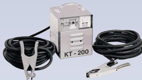
E Pipe Thawer