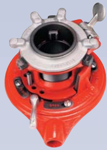
A Threader - Manual (65)