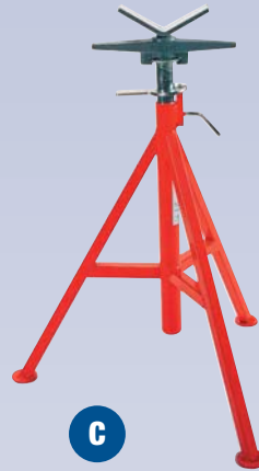
C Fabrication Stand