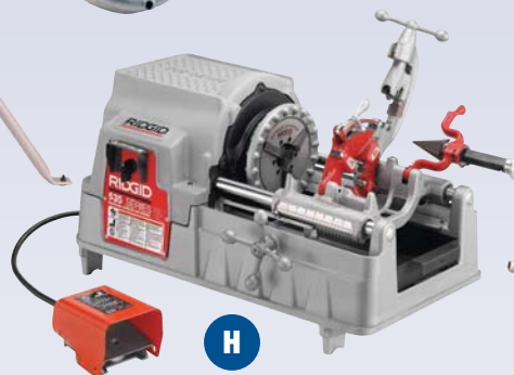
H Threader - Electric (535)