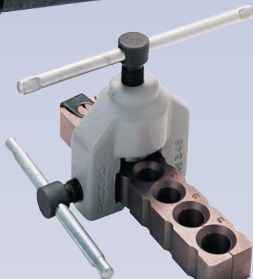
B Flaring Tool