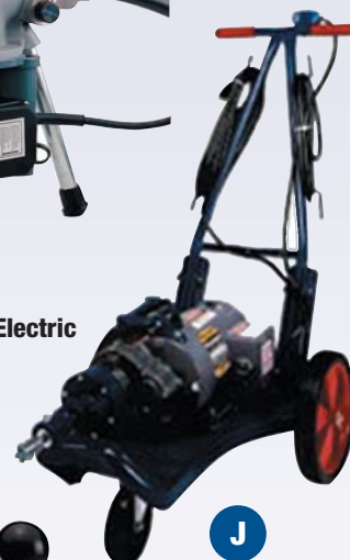
J Drain Cleaner - Electric