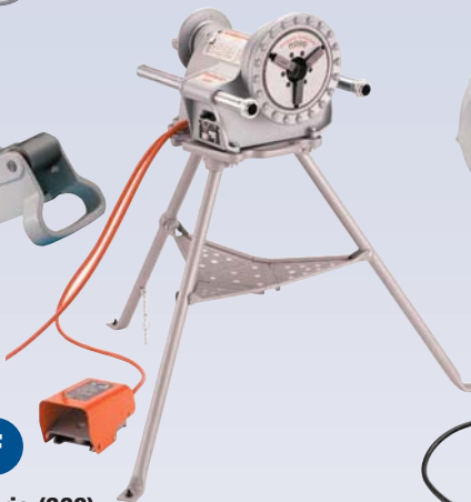
F Threader - Electric (300)