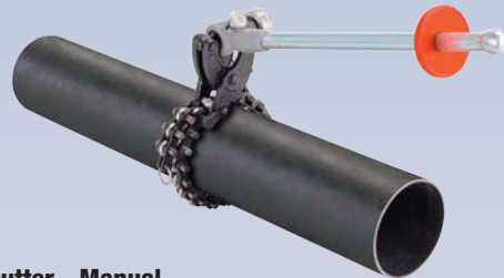
D Pipe cutter - Soil - Manual