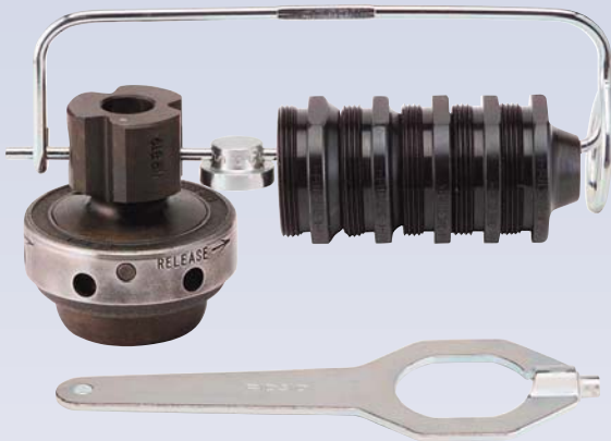
E Nipple Chuck