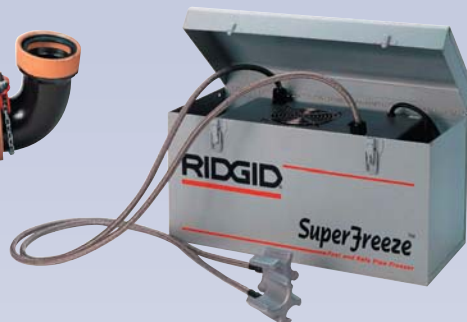
D Pipe Freezer