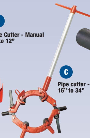
C Pipe cutter - Manual 16" to 34"