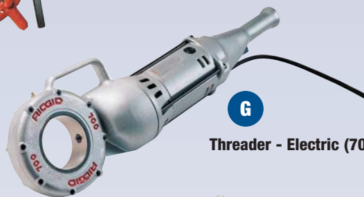
G Threader - Electric (700)