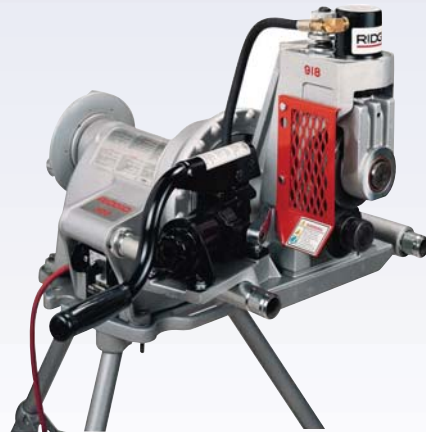
I Roll Groover