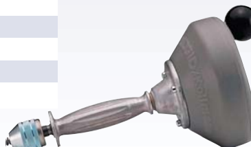
K Drain Cleaner - Manual