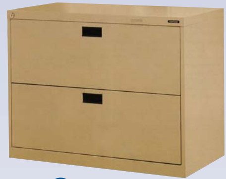
G Filing Cabinet