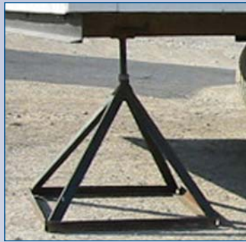
B Tripod Stand