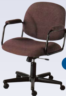
E Chair - Swivel