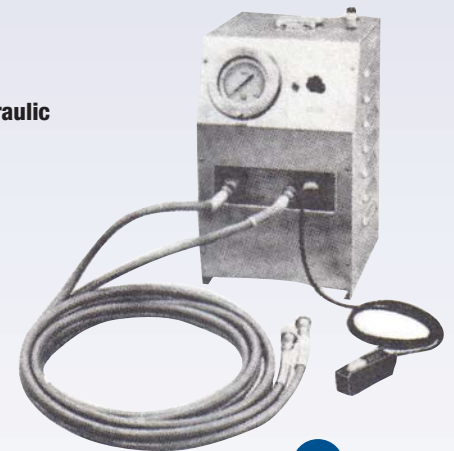
Torque Wrench - Hydraulic