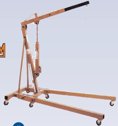
F Portable crane - 1000 lbs