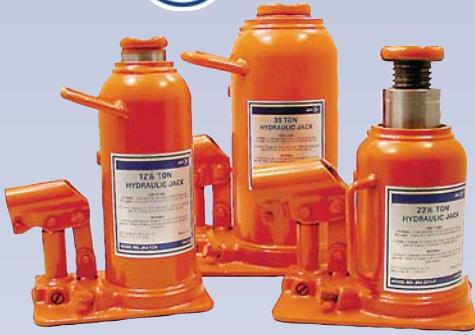
A Hydraulic jack