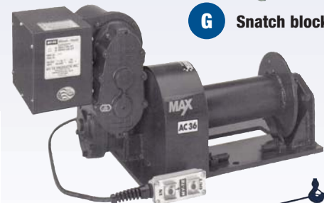
H Electric winch