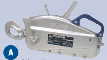
A Grip puller