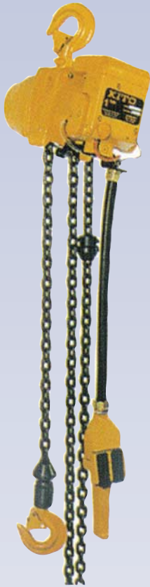
B Electric chain block