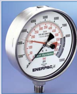
E Hydraulic gauge