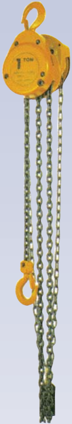
A Chain block