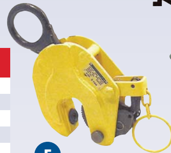
F Plate-lifting clamp