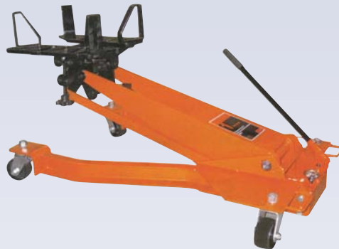
E Transmission jack