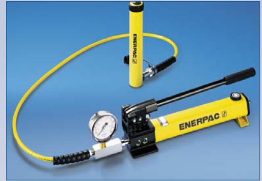
C Manual hydraulic pump