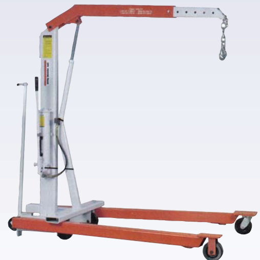
G Portable crane - 4000 lbs