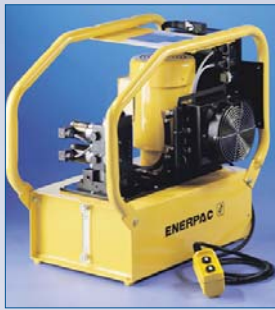
D Electric hydraulic pump