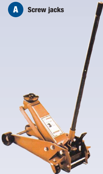
D Service jack