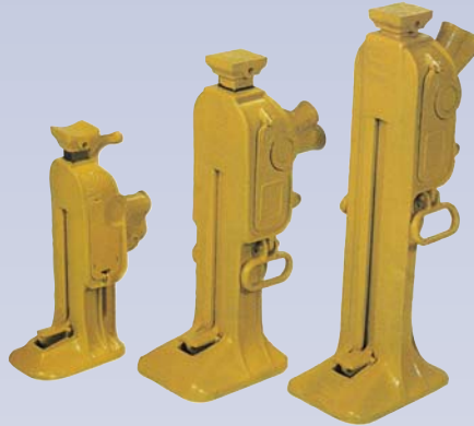
B Mechanical jacks