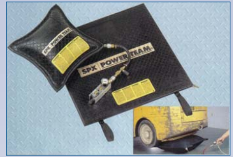
C Inflatable jack