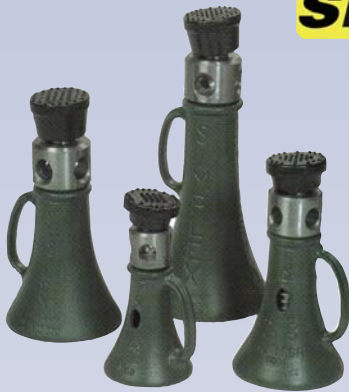
A Screw jacks

SIMPLEX A Division Of Ferguson, Kelly & Co., Inc.