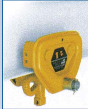
C Beam trolley