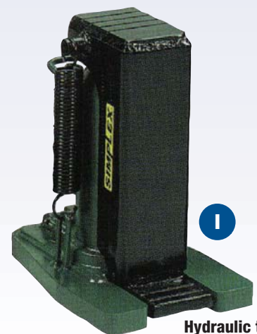
I Hydraulic toe jack