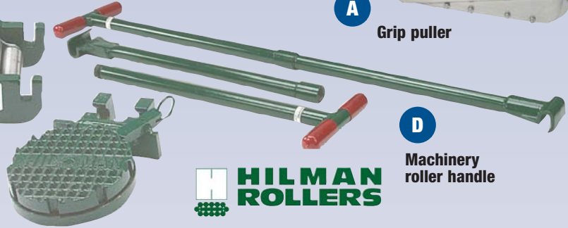
D Machinery roller handle