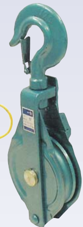
G Snatch block