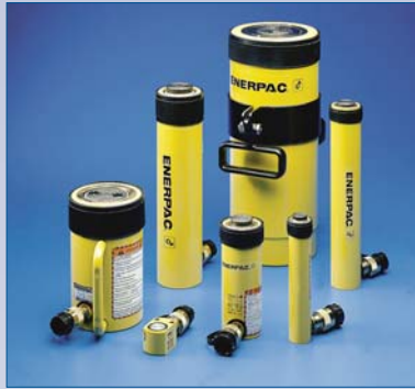
B Hydraulic cylinder