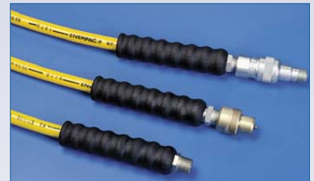
H High-pressure hose