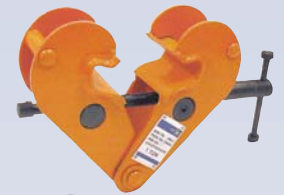
E Beam clamp