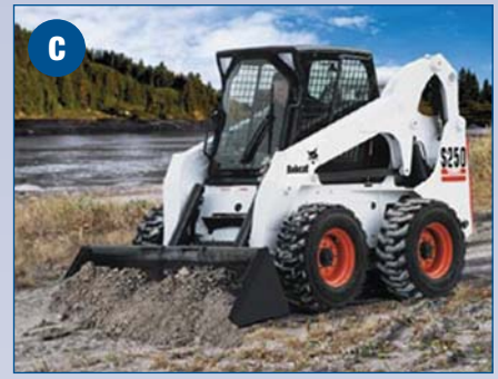
Loader - 2500 lbs