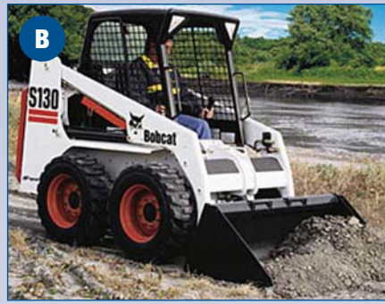
Loader - 1300 lbs