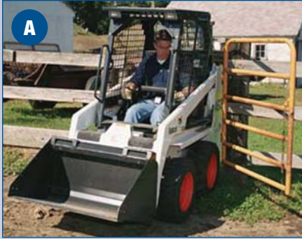
Loader - 700 lbs