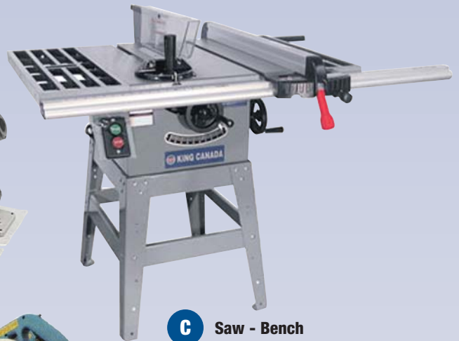
C Saw - Bench