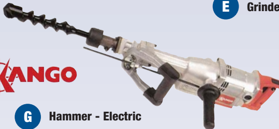
G Hammer - Electric