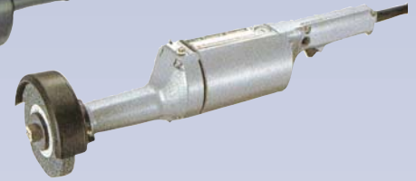
C Grinder - Straight - Electric