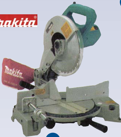
D Saw - Miter