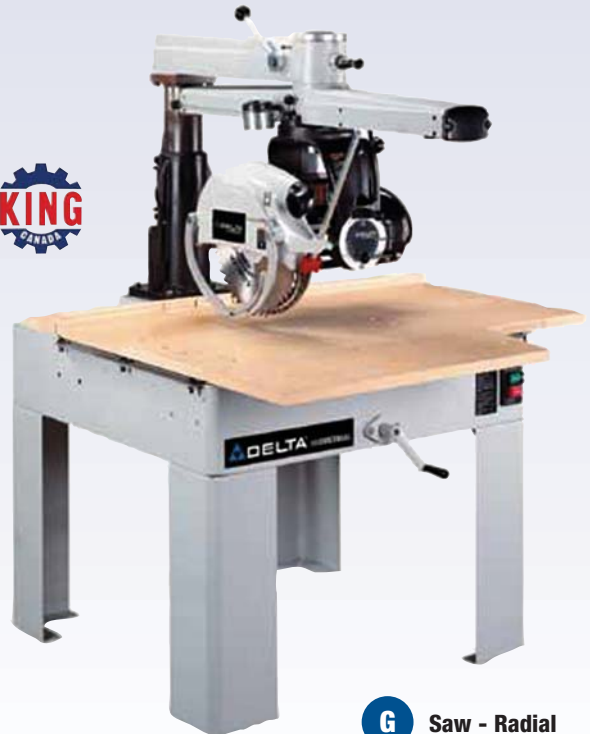
G Saw - Radial