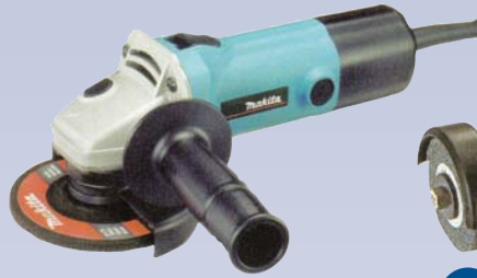
B Grinder - Angle - Electric