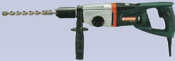
A Drill - Hammer - Electric