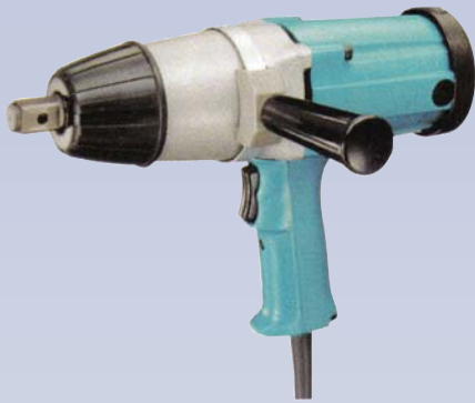
A Impact wrench