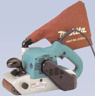
B Sander - Belt