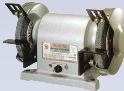
E Grinder - Bench