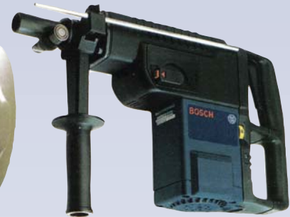
F Rotary Hammer - Electric