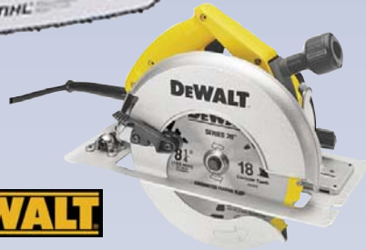
B Saw - Circular