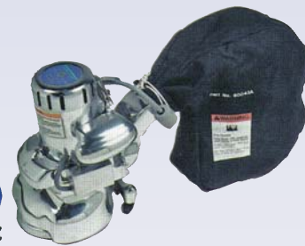
E Floor Sanding Set