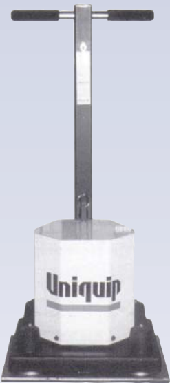
D Sander - Orbital - Floor