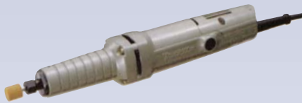
D Grinder - Die - Electric