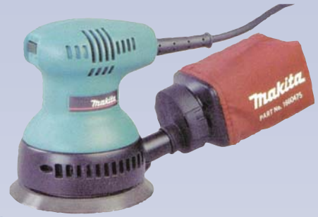
C Sander - Orbital