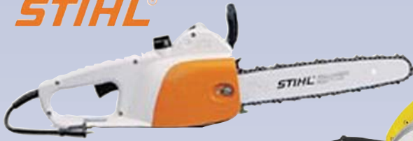
A Chainsaw - Electric