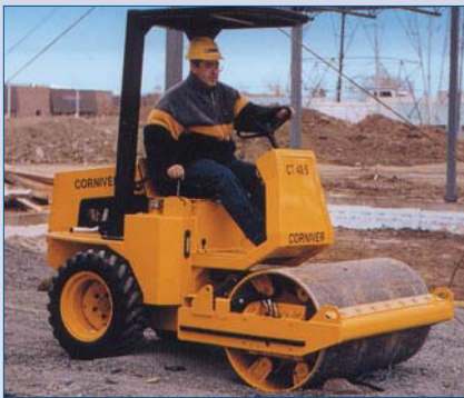
B Vibratory Roller - CT40