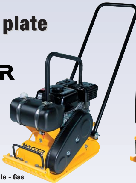
C Vibratory plate - Gas