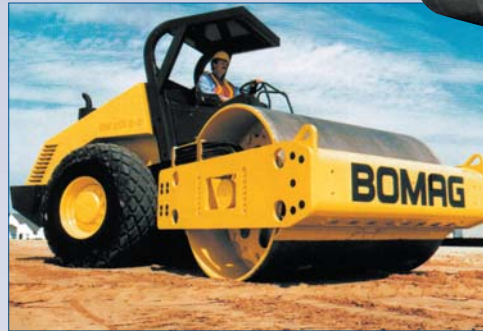
C Vibratory Roller BW213