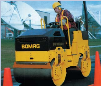
A Vibratory Roller - BW90AD