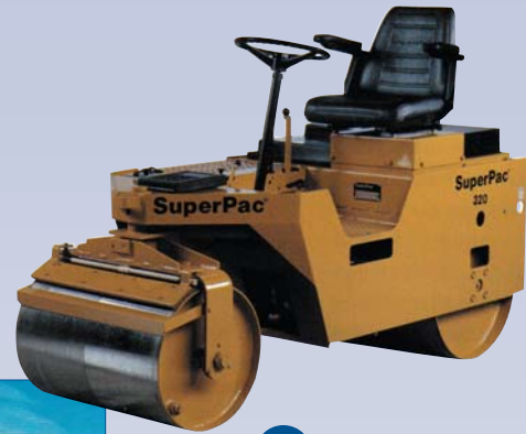
D Asphalt Roller