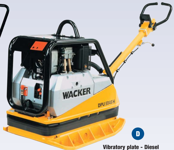
D Vibratory plate - Diesel